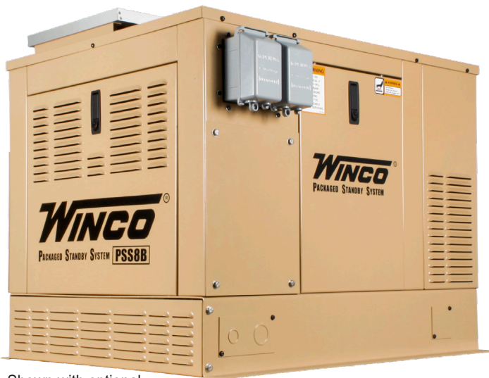
Shown with optional solar panel and receptacles.